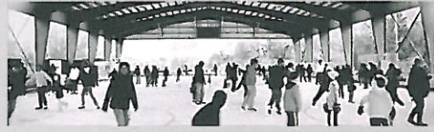
Healthy Zone Ice Rink – 2015 Location of Health Live!